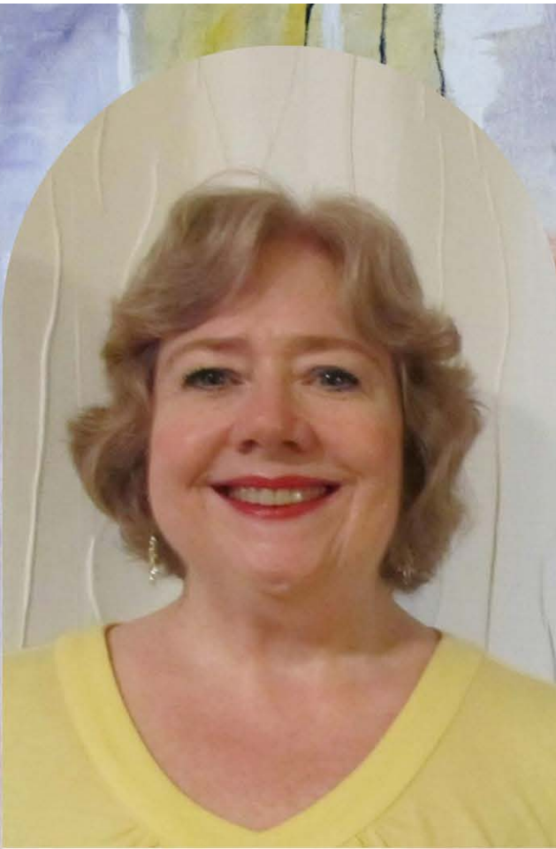
NEW MEMBER SPOTLIGHT