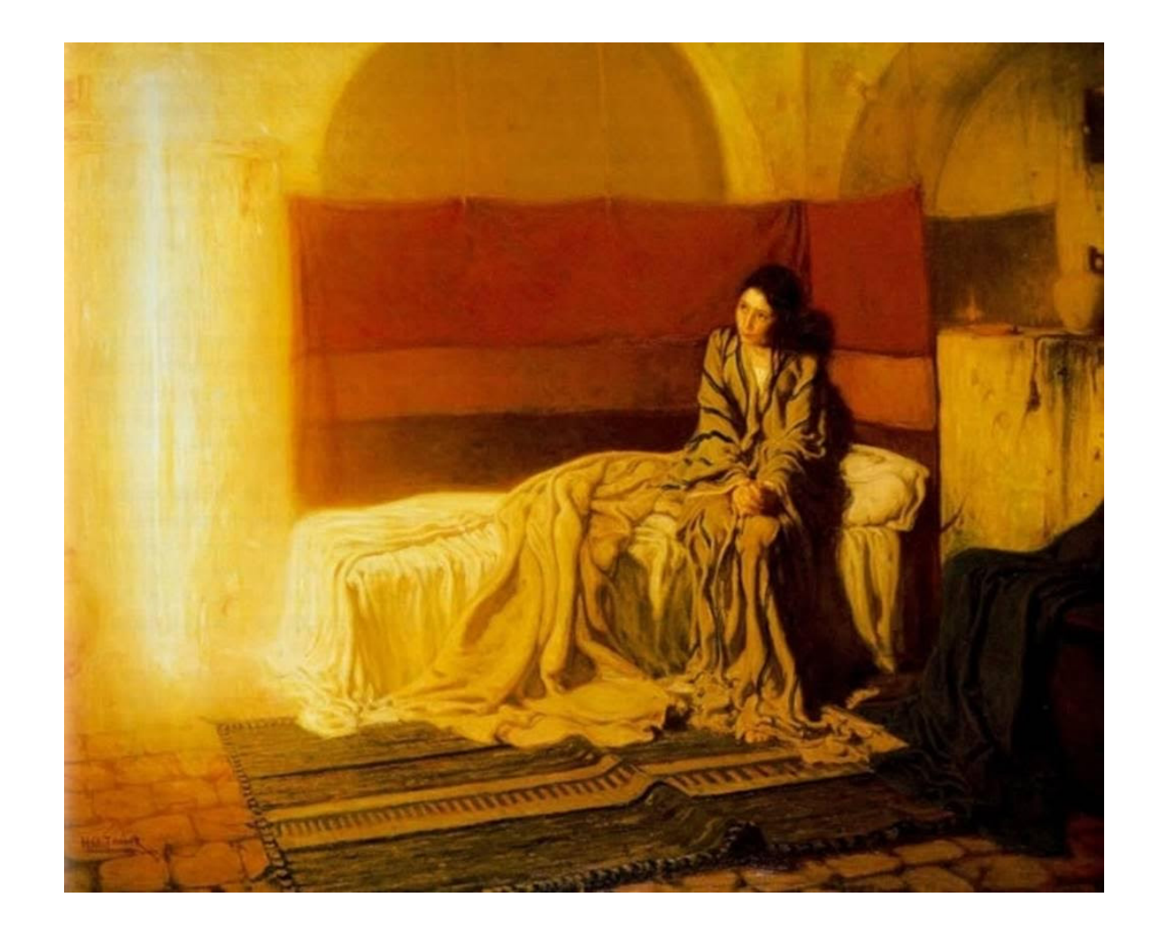
Henry Tanner's painting The Annunciation painted in 1898. It hangs in the Philadelphia Museum of Art.