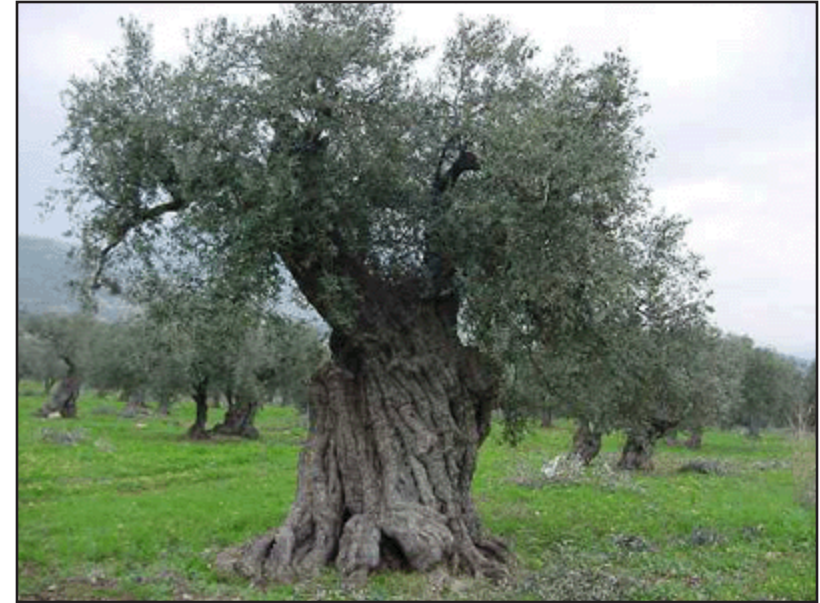
Olive Wood Trees

Postlude O Come, All Ye Faithful arr. Blersch