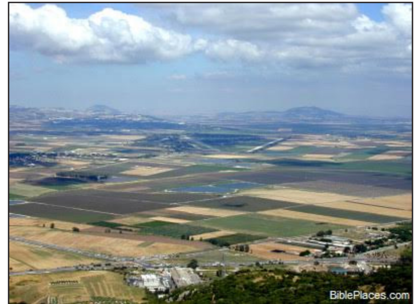
The Jezreel Valley